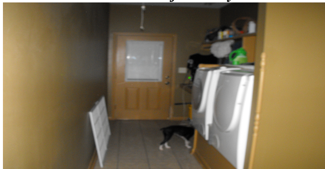
Back End of Hallway

EQUIPMENT: Digital Cameras, Infrared cameras and DVR system, Digital audio recorders, P-SB7 Spirit Box, Digital thermometers, Various EMF meters including Tri-Fields, Dragon Speak communications device and EMF pump.