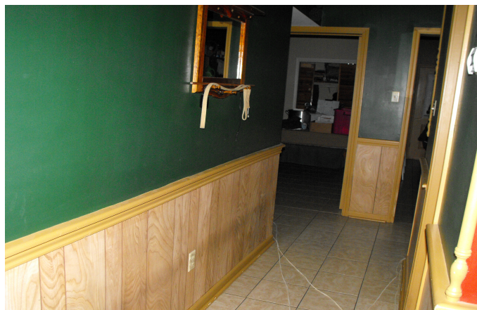
Center of Hallway

LaSpirits would like to thank the clients for inviting us into their home, and for the opportunity to study the phenomena there. We would also like to thank them for their most gracious hospitality, and hope they will call on us if any other problems arise.